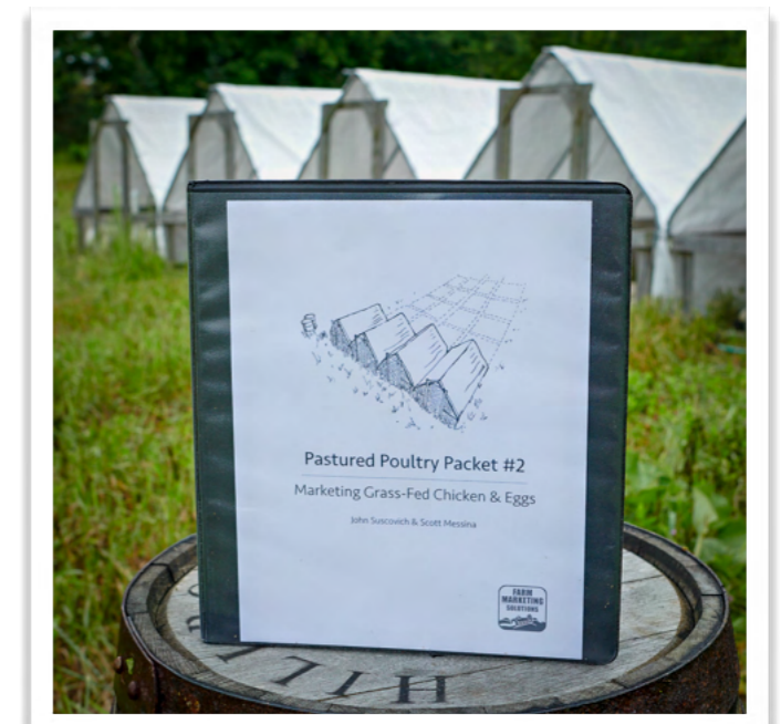
Pastured Poultry Packet #2: Marketing Grass- fed Chicken & Eggs