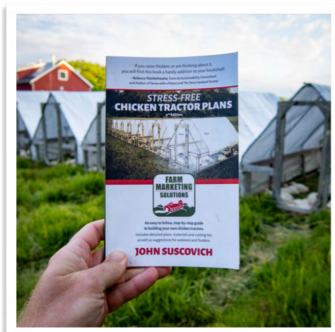
Stress-Free Chicken Tractor Plans