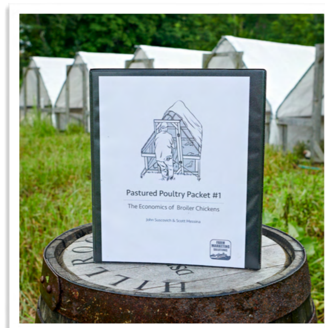
Pastured Poultry Packet #1: The Economics of Broiler Chickens